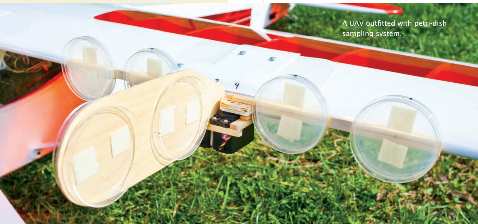
A UAV outfitted with petri-dish sampling system.